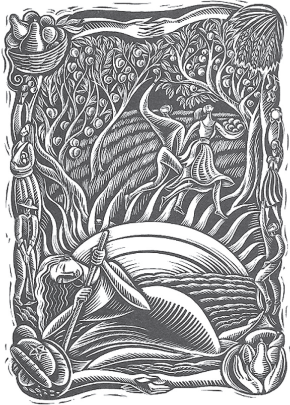
Design and layout by Glenda Jones