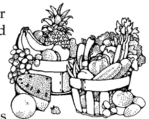
design and layout by Glenda Jones